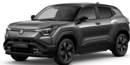
GRANDEUR GREY PEARL METALLIC