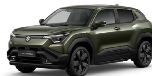
LAND BREEZE GREEN PEARL METALLIC