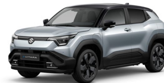
SPLENDID SILVER PEARL METALLIC