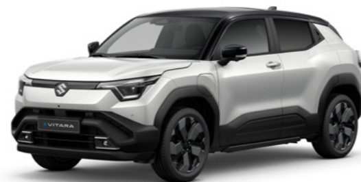
ARCTIC WHITE PEARL