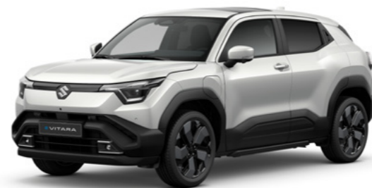
ARCTIC WHITE PEARL