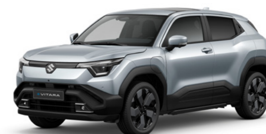
SPLENDID SILVER PEARL METALLIC