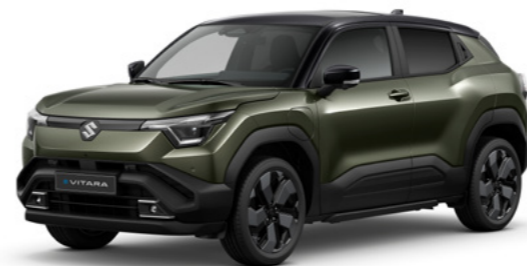
LAND BREEZE GREEN PEARL METALLIC