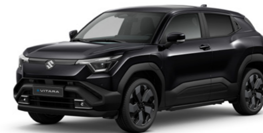
BLUISH BLACK PEARL