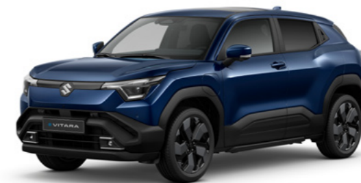
CELESTIAL BLUE PEARL METALLIC