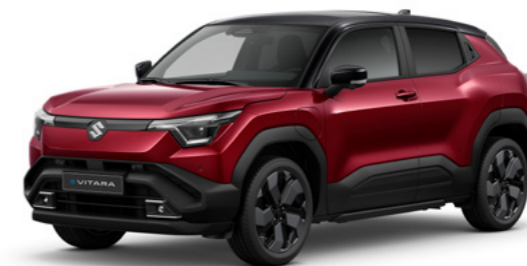
OPULENT RED PEARL METALLIC